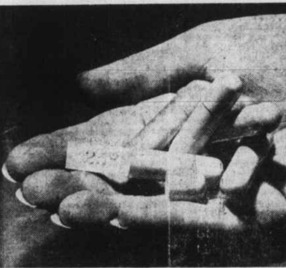
These are actual samples of the capsules to be used at the national draft lottery to be held in Washington, D. C., a week or so after the draft registration. Number 258, the number photographed, was the first number drawn during the 1917 lottery. Numbers are printed on white cardboard and inserted inside the capsules.