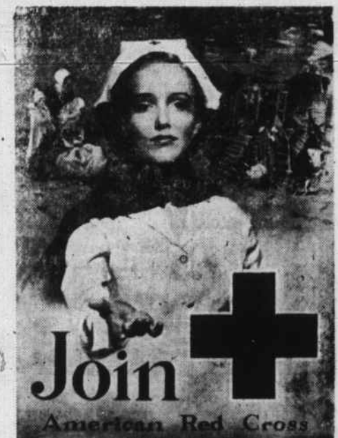
Join American Red Cross

Call Us for the Best Nos. 1 and 2 Fuel Oil for Homes, Farm Use and All Purposes