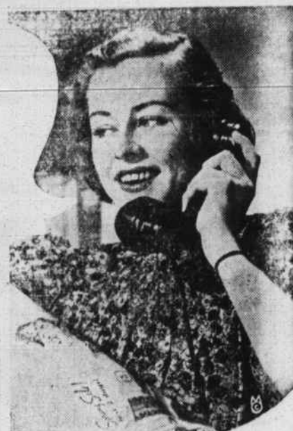
MISS TEXACO They All Call For Texaco