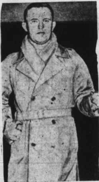
Here is a recent photo of William Joyce, renegade Englishman who the British say, broadcasts from a Berlin radio station nightly. The British, who enjoy his broadcasts call him Lord Haw-Haw.