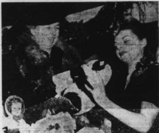
Mrs. Franklin D. Roosevelt sets an example to the women of the nation by doing her Christmas shopping early. She is pictured in a Fifth Avenue shop, in New York, selecting toys for her grandchildren.