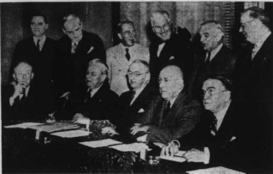
The Senate foreign relations committee is pictured as it convened in Washington to debate the possibility of further aid to Britain. Seated (left to right) are Senators Pat Harrison of Mississippi, Hiram W. Johnson of California, Walter F. George of Georgia, chairman; Elbert D. Thomas of Utah and Frederick Van Nuys of Indiana. Standing are Senators Gerald P. Nye of North Dakota, Arthur H. Vandenberg of Michigan, Theodore F. Green of Rhode Island, Guy M. Gillette of Iowa, Joseph F. Guffey of Pennsylvania and Bennett Champ Clark of Missouri.