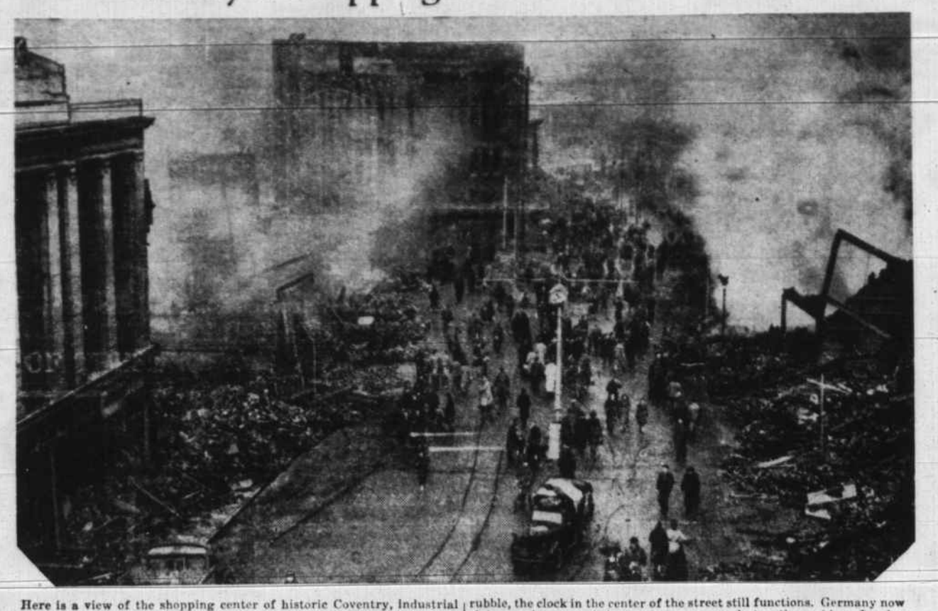
Here is a view of the shopping center of historic Coventry, Industrial rubble, the clock in the center of the street still functions. Germany now city in the English Midlands, following a pulverizing raid by Nazi claims to have carried out an even more destructive raid on London bombers. Although the surrounding buildings have been blasted into in which 800 tons of bombs were dropped.

water and 1 c sait. Allow to stand burking pair. Flace meat on trivel 12 hours, then drain off the saited water and rinse with clear boiling (500*) until lour is browned but water. Stuff opossum with follow-not burned (about 5 min.). Add boil-