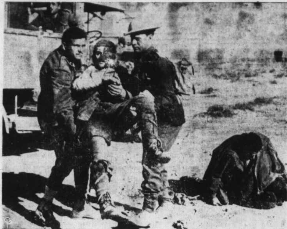
A British officer assists an Italian prisoner in carrying a wounded Italian soldier to an ambulance for removal to a dressing station after the victorious British assault on the Libyan port of Tobruk. Another wounded Italian is on the ground, awaiting assistance.