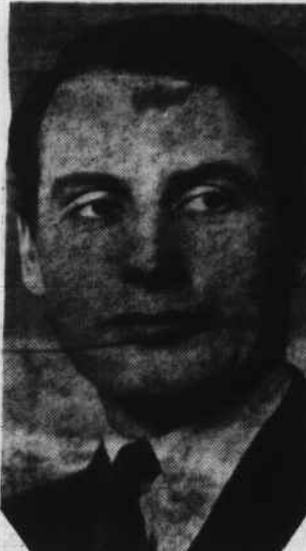
Britain's new High Commissioner to Canada, Malcolm MacDonald, former Minister of Health in the British Cabinet, arrives at his Ottawa post.