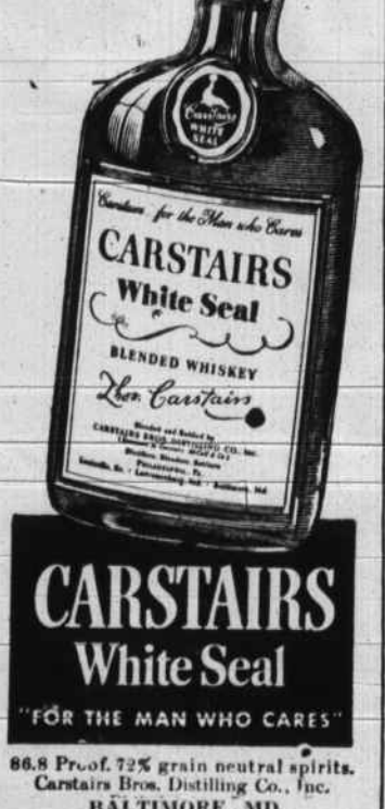
86.8 Pro. of 75% grain neutral spirits. Carstairs Bros. Distilling Co., Inc. BALTIMORE, MD.

This was an advance step in streamlining democracy, for at that time no court had ever declared a legislative act contrary to the constitution.