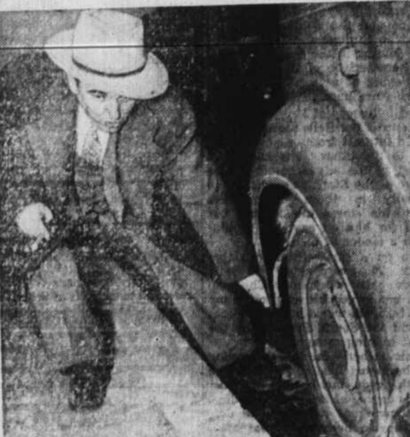
Lon Henderson, price administrator, put a ban on the sale of new cars, with no exceptions. Here, the administrator straightens a fender on his own car in Washington, as the no-sale ban prevents his trading in the old jalopy for a new model. He assured present car owners the government has no intention to commandeer use of new cars.