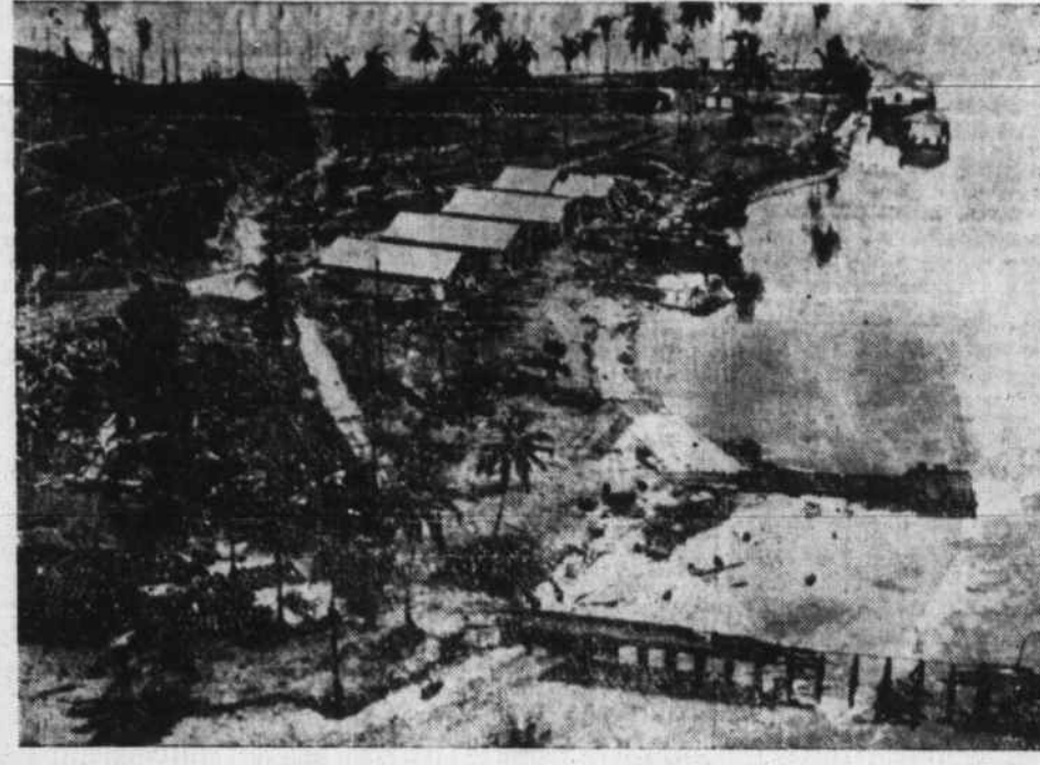
This is an aerial view of E. Tanambago Island in the Solomons, after U. S. planes had given it a terrific bomb blasting. Note the wrecked pier in the foreground and damaged fronts of the buildings. This attack was launched during the drive to oust the Japs from the Solomons. The Nipponese are making a desperate bid to recapture Guadalcanal Island from which they were driven by the U. S. Marines. This is an official U. S. Navy photo. (Central Press)

always a danger; greater care should be observed in this wartime year. Don't let insanitary livestock quarters endanger profits; all stock barns should be cleaned and disinfected before cold weather. Don't risk ruining the dairy herd through mastitis. If any cows show inflamed udders or abnormal milk, have them examined. Don't forget that livestock needs plenty of vitamins during damp, dark fall and winter weather. Vitamin A and D are all important. In livestock