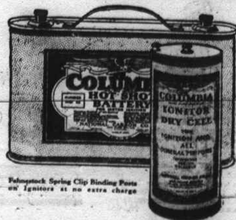
Felmore Spring Clip Binding Posts and Ignitors at no extra charge