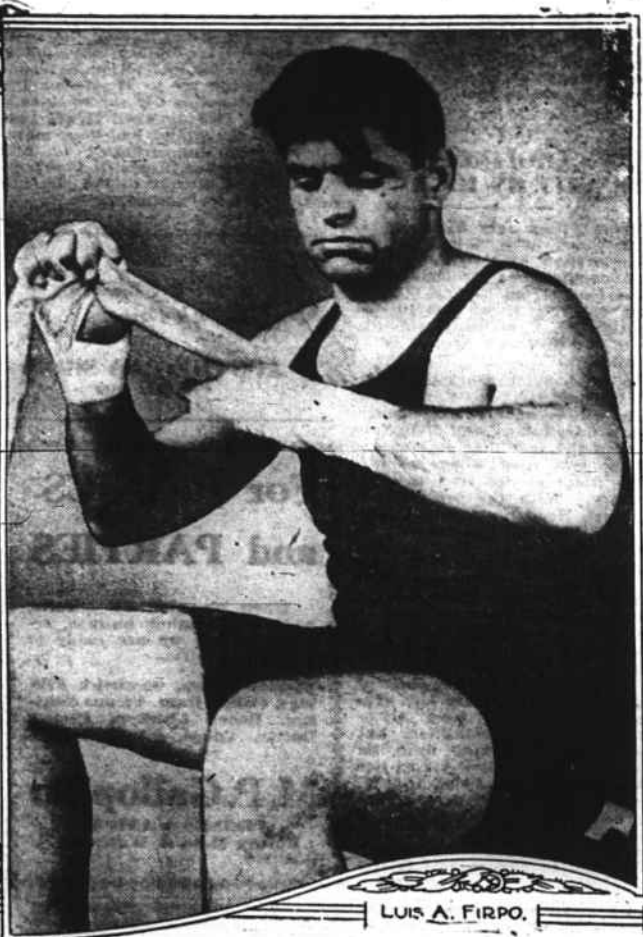
LUIS A. FIRPO.