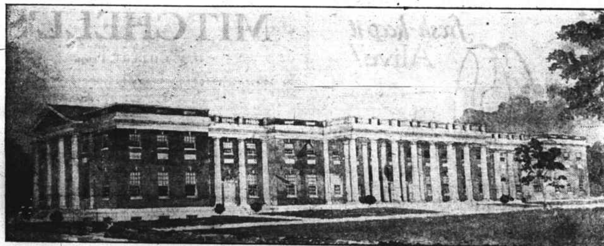
PERSPECTIVE OF THE GRAHAM MEMORIAL BUILDING