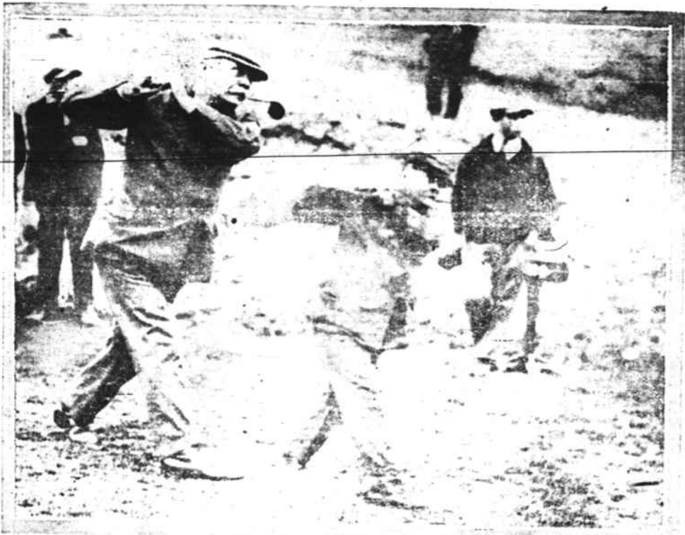
For the benefit of the skeptical it may be explained that this photograph was taken amid very material surroundings at the Westchester, Biltmore Country Club at Rye, N. Y., where Sir Arthur understood the course. Just how the trick was done experts in the use of the camera will doubtless at once

front of an approaching train and was struck.