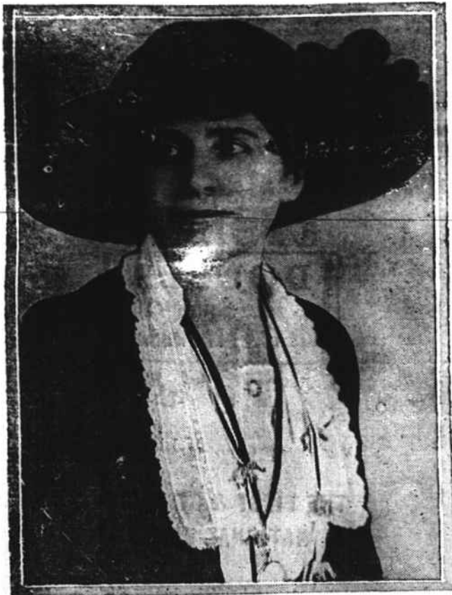
Mrs. Calvin Coolidge, who was Miss Grace Goodhue of Burlington Vt. a former school teacher, and was married October 4, 1905.