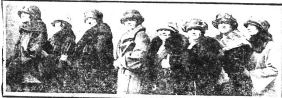
These eight women represent the "milder squad" of the New York City police department. It is their duty to arrest men who carry their flirtations to extreme points. And they are being very effective. They would not allow their names to be used in connection with these men.