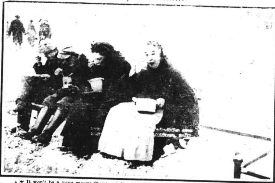
It won't be a very merry Christmas for these Germans. The photo just arrived from Berlin.

CHURCHES SEEK BUSY MEN (Special Dec. 24.)—In order to attract business men to the churches, the churches are having services every morning and evening. The Lord's supper is served every Saturday night because of the tendency of the city population to spend Sundays in the country.