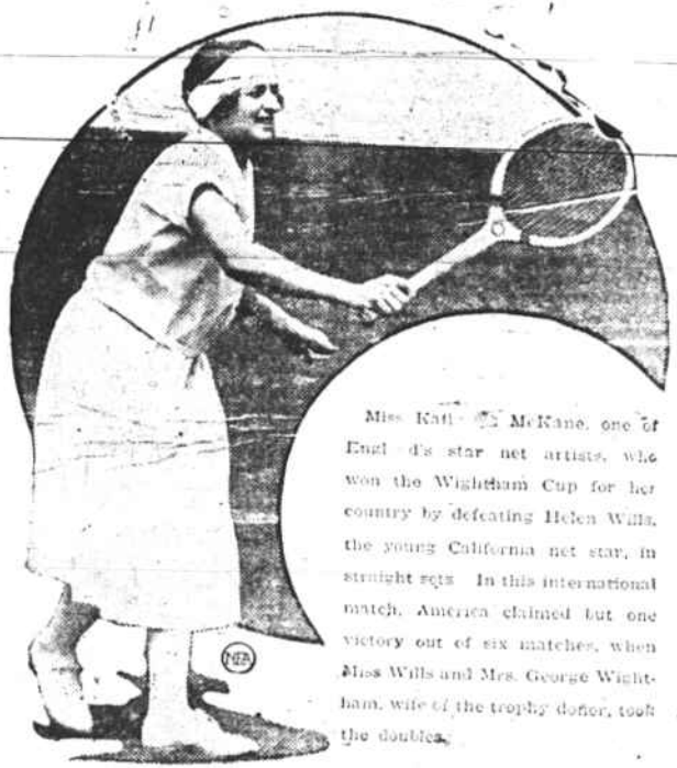
Miss Kathleen McKane, one of England's star net artists, who won the Wimbledon Cup for her country by defeating Helen Wills, the young California net star, in straight sets. In this international match, America claimed but one victory out of six matches, when Miss Wills and Mrs. George Wightman, wife of the trophy donor, took the doubles.

Gosh, how we hope this is the last day of the convention.