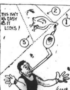
Cut out the picture on all four sides. Then fold carefully dotted line 1 its entire length. Then dotted line 2, and so on. Fold each section underneath. When completed turn over and you'll find a surprising result. Save the pictures.