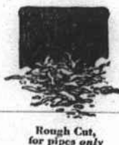
Rough Cut, for pipes only