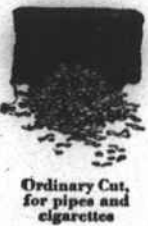
Ordinary Cut, for pipes and cigarettes

No tins, no sir — packed in foil therefore 10¢