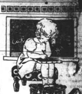
To the Boy or Girl that will bring the greatest number of the above picture to Zoeller's Studio between now and November 1st will be given a nice KODAK.

Nebraska, to provide for nomination by direct primary of candidates for United States senator, representatives in Congress and state and county elective officers.