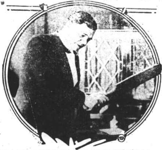
The boys handed Babe Ruth a cricket stick the other day and the man who made home running an art in this country took a preliminary swing with the chief offensive weapon of England's favorite sport. "It might be all right to use in slapstick comedy," commented the Babe, "but I'd hate to hit against Walter Johnson with it."