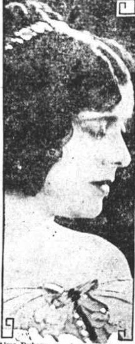
Alma Rubens, movie actress, is seeking a divorce again. She charges her husband, Dr. Daniel Carson Goodman, physician, author, director and film magnate, with cruelty. In 1918 she was divorced from William Smith, professionally known as Franklyn Farnum, on the same ground.

al one. Studying stenography and typewriting for only six months a year ago in a statewide typing contest, she won second honor. Her "little red diary," which bears sordid entries regarding liquor drinking and jazz mania parties, also has been described in bits of poems and philosophies which are "done" enough to be within the ken of persons many years her senior.