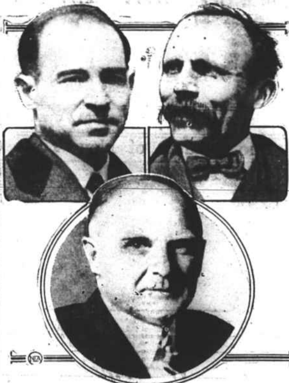
Final decision of the celebrated Sacco-Vanzetti case is expected soon from Governor Fuller of Massachusetts (lower picture). Sacco and Vanzetti (left to right above) are reported on a hunger strike.