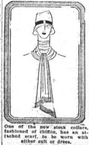
One of the new stock collars, fashioned of chiffon, has an attached scarf, to be worn with either suit or dress.