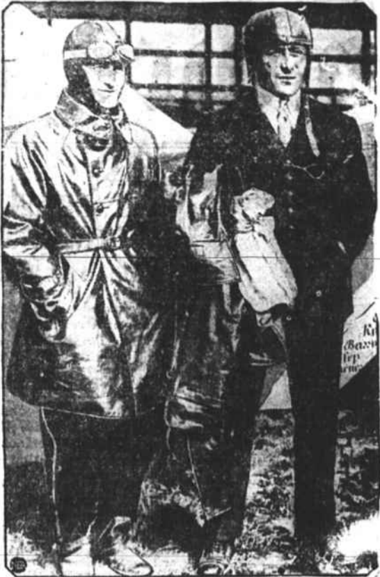
Where Nungesser and Gull failed, Captain Rignot and Lieutenant Diendonno Coste (left to right above) hope to succeed. They're reported about ready to take off from Paris on a non-stop flight to New York. They will fly a Breguet one-motored biplane in which they already have set a record of 2415 miles of continuous flight—a record that remained for Lindbergh to break with his epochal journey in the "Spirit of St. Louis."