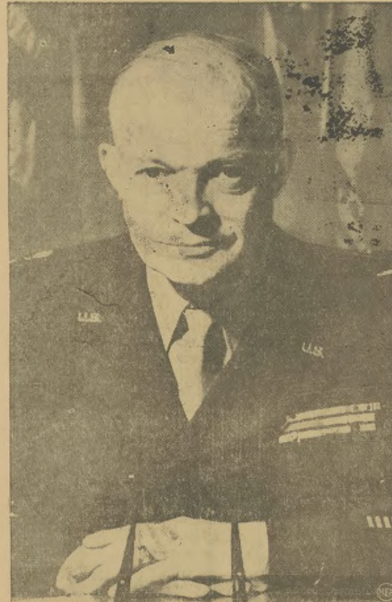
It was General Ike Eisenhower, above, who asked German General Jodl, surrendering the master of the Reich, if he understood the terms of the surrender and accepted the surrender when General Jodl answered "Yes."