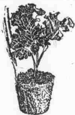
Grand Rapids Lettuce Plant. [Growth in pot for transplanting to bench or box.]

A combination method of indoor and outdoor lettuce culture that sometimes works nicely is starting head lettuce in the greenhouse, hot-bed or cold frame and transplanting to the open as soon as the weather is favorable. Not only do we thus get earlier lettuce, but the development of head lettuce seems to be very fine under these conditions. Deacon, Big Boston, May King, Black Seeded Tenisball, Market Gardener's Private Stock, Iceberg and Improved Hanson are varieties suitable for this combination culture.