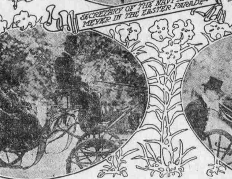
ATTORNEY GENERAL AND MRS. WICKERSHAM

display and how far back, in point of time, have extended the preliminaries for the burst of glory. Millady may not even realize that the milliners who "did" her hat have been working literally night and day for a fortnight before Easter and that the delivery boy who distributed the "confections" of lace and ribbons, had precious little sleep on Easter eve. But the trill of preparation goes yet farther back. It extends as far as fascinating Paris, where all the styles originate and where the ammunition for the Easter broadside was a matter of concern to hundreds of designers and seamstresses and bonnet makers and flower workers in the days when you and I were busy with Christmas preparations. There is usually at least three or four months between the in-