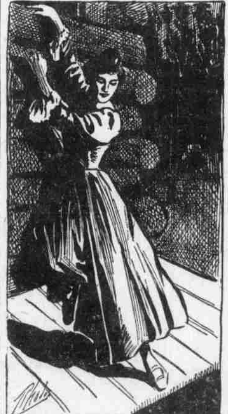
The Way of Egress Was Easy.

The way of egress was easy—a mere step to the flat roof of the kitchen, the dovetailed logs of which afforded