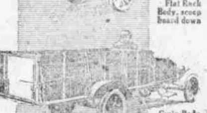
Flat Rack Body, scoop board down