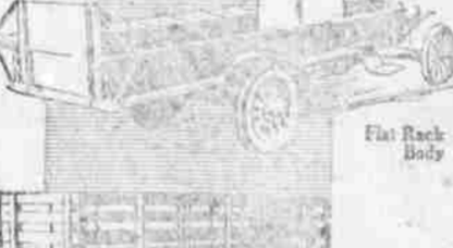
Flat Rack Body