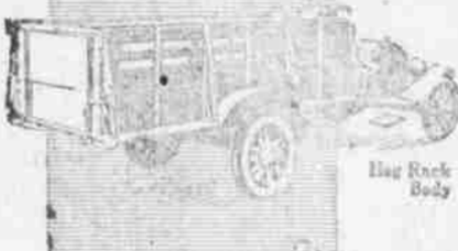
High Rack Body