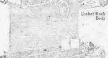
Cabinet Rack Body