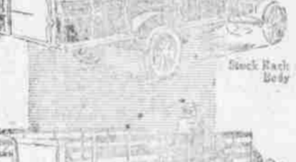
Stock Rack Body