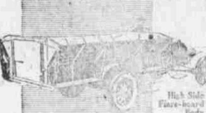
High Side Frame-body