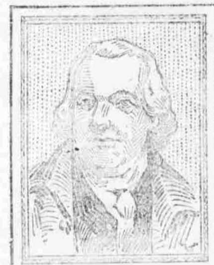
Robert Morris Financier of the REVOLUTION