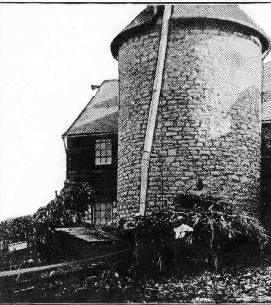
FARMER CANNOT AFFORD TO BE WITHOUT SILO.

Evenly Distributed. In this manner the ensilage is evenly distributed all over the silo, which is not the case when the cut corn merely falls from the top either with a blower or chain carrier. The heavier parts of the ensilage such as kernels and pieces of ears will fall closer to the