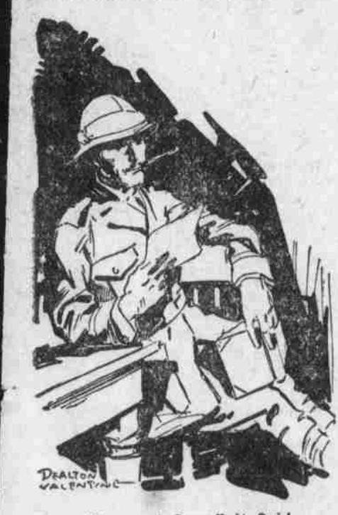
'Come at Once," It Said.

In the train on the way to Peshawur | ruled her." he was not troubled by forced conersation. Consequently he reached heat. And his genial manner of salut- tive. ing the full-general who met him with a dogcart at Peshawúr station was her that'll take you into Khinjan