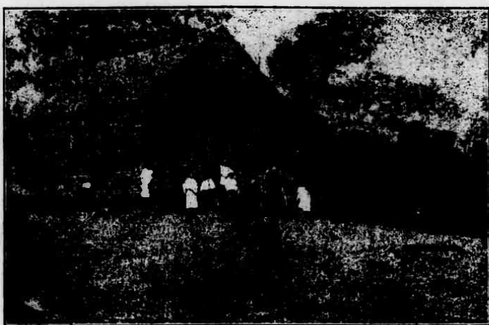
OLD SCHOOL HOUSE

A summary of statistics showing the progress of the schools of Transylvania county during the past decade under the superintendency of Prof. T. C. Henderson makes a flattering showing. The following shows the progress made by the Lake Toxaway school, Hogback, No. 4: