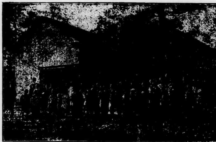
NEW SCHOOL HOUSE