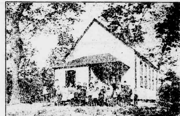
Old Toxaway School House, New