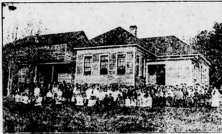
Rosman School House, New