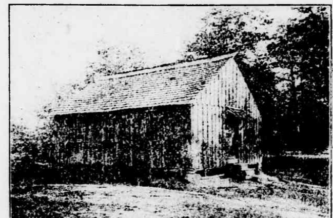
Old Toxaway School House, Old