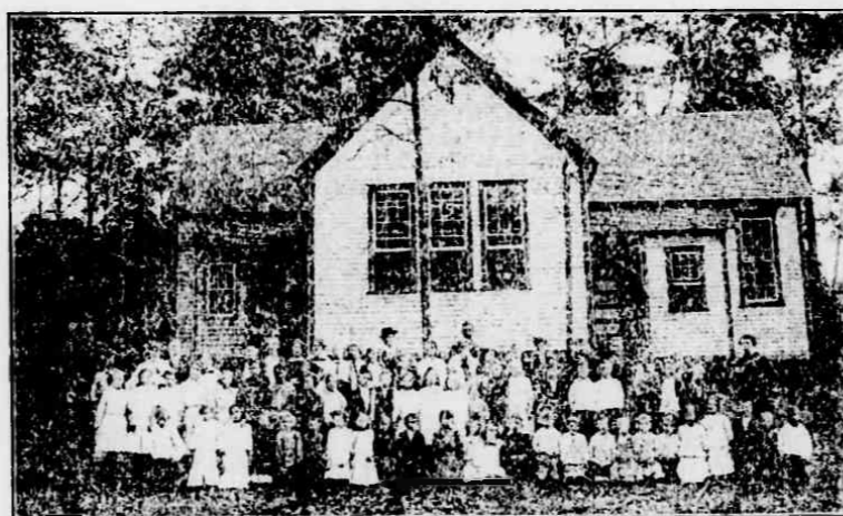
Quebec School House, New