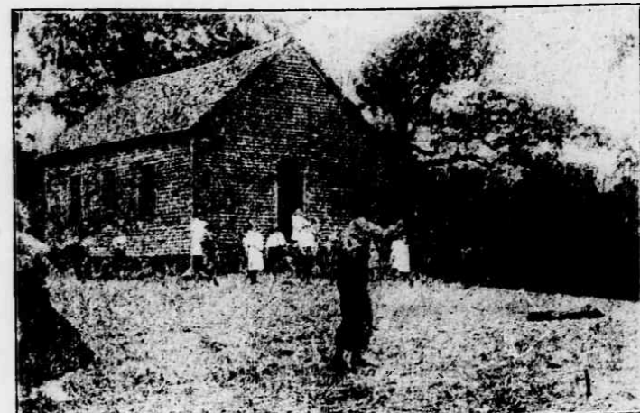
Lake Toxaway School House, Old