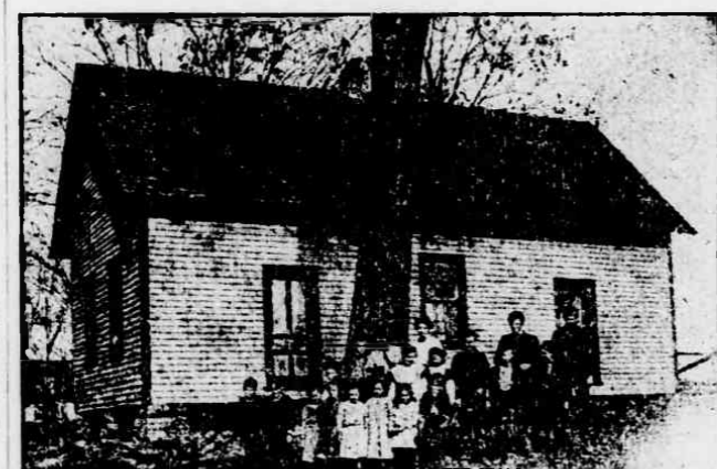
Davidson River School House, Old