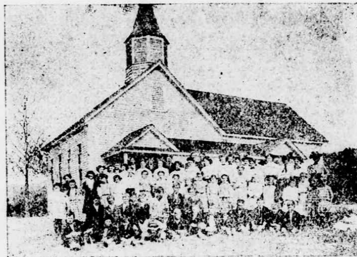
Little River School House, New