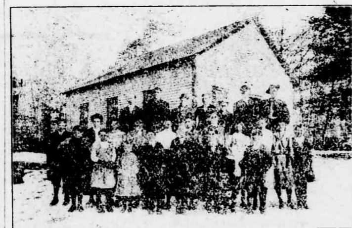
Calvert School House, Old