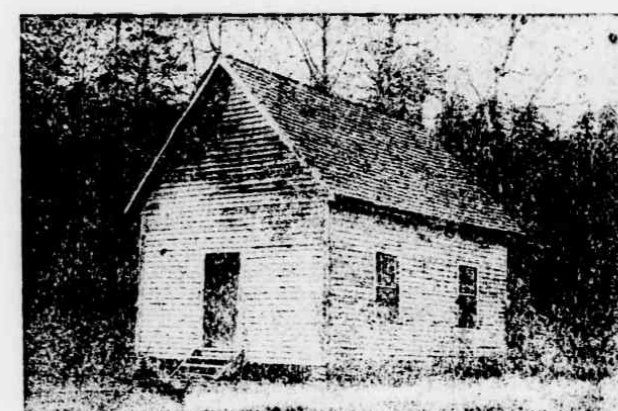
Selica School House, Old