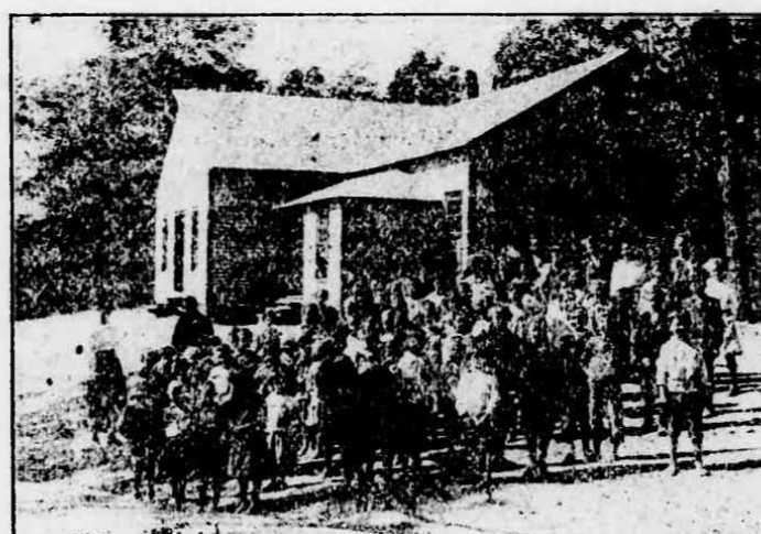
Calvert School House, New