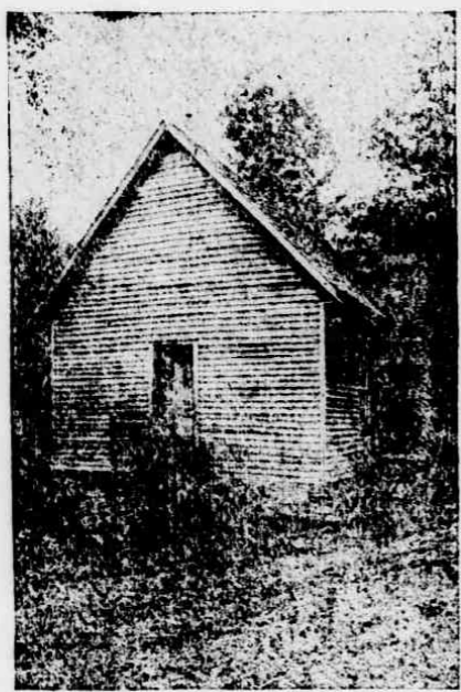
Rosman School House, Old