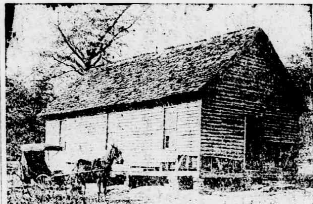
Little River School House, Old