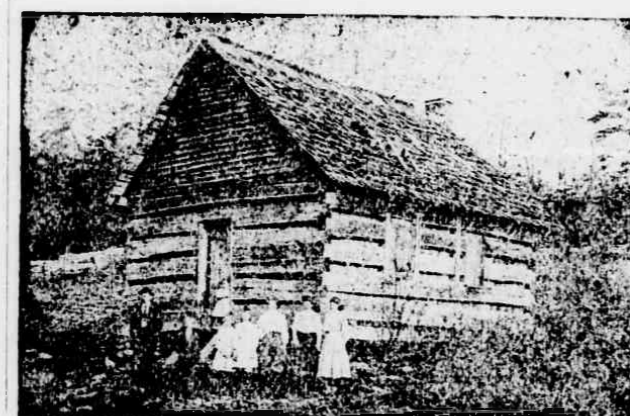
Quebec School House, Old