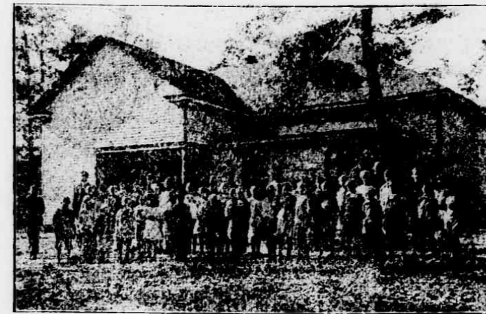
Lake Toxaway School House, New