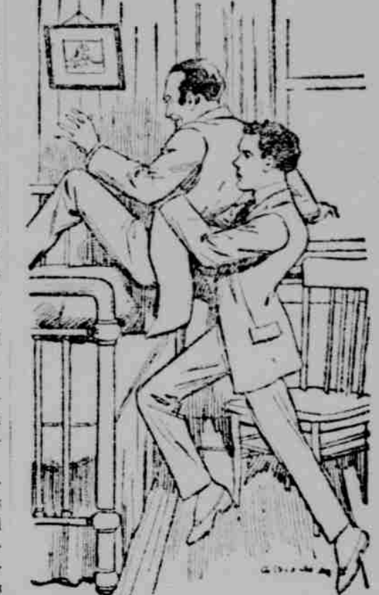
A Moment Later He Was Infinitely More Astonished.

Reinforcements Arrive and Western Front Extends From North Sea to Adriatic—War Department's Weekly Review Is Issued.