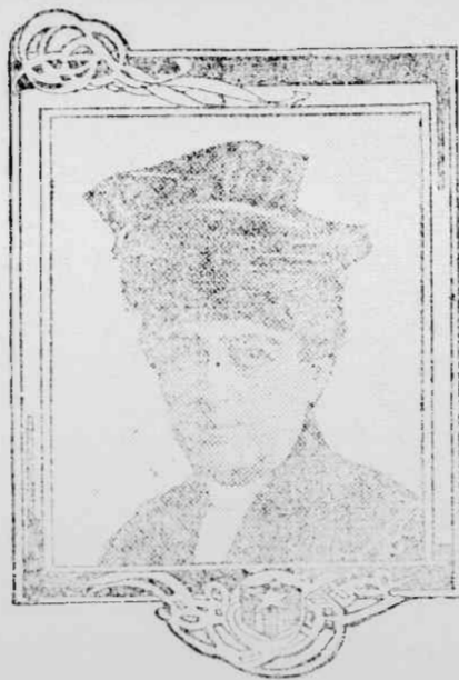
MRS. THOMAS J. PRESTON, JR.

Mrs. Thomas J. Preston, Jr. (formerly Mrs. Grover Cleveland), who was recently elected a member of the Executive Committee of the National Security League, the first woman to be so honored, has joined the executive staff of the league as secretary of the Committee on Patriotism Through Education, through which the league is promoting a campaign throughout the country to awaken the people to a realization of the true