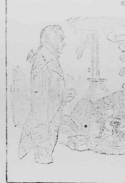
Spirit of Major Andre: "They treated spies differently in my time, and yet I was a gallant gentleman compared to these reptiles!"

"IT WAS NOT LIKE THIS IN THE OLDEN DAYS!"