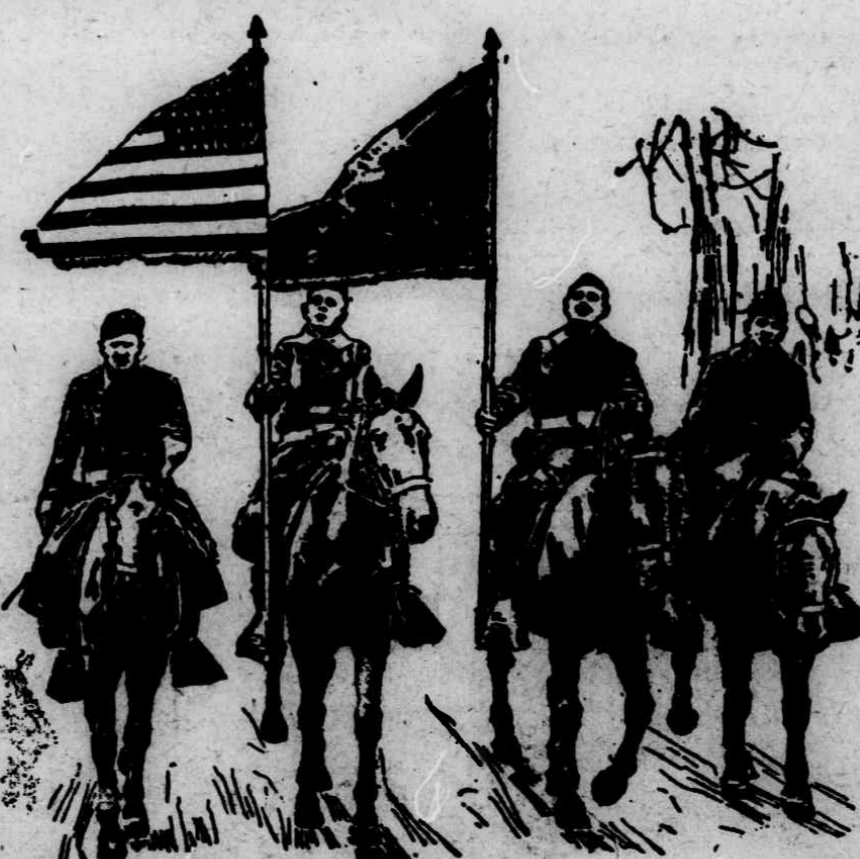
First American Flag to Enter Germany With Our Army of Occupation. The Victory Liberty Loan will pay the bills for maintaining our Expeditionary Forces overseas.

"Do you think I could rest a minute, Doc, before you do the second one?" "Red, raw, wet flesh"—American flesh. It was not yellow. Think of that when you are asked to buy Victory Liberty bonds, you who think you have done enough.