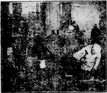
The village blacksmith shop under the spreading chestnut tree is for rent. The smithy has gone to sea to learn some new tricks of the trade in the U. S. Navy schools.

Blacksmithing is now a highly specialized trade in iron working. Once a man masters it he is sure of a good living for life, either in or out of the service.