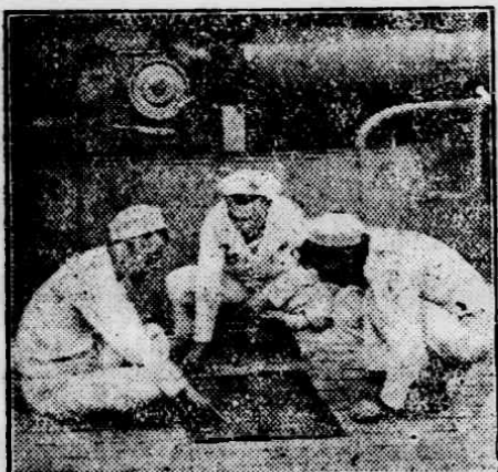
Rolling the Bones.

No indeed, they're not shooting craps. They are playing "Acy-Doucic," a perfectly safe and sane pursuit.