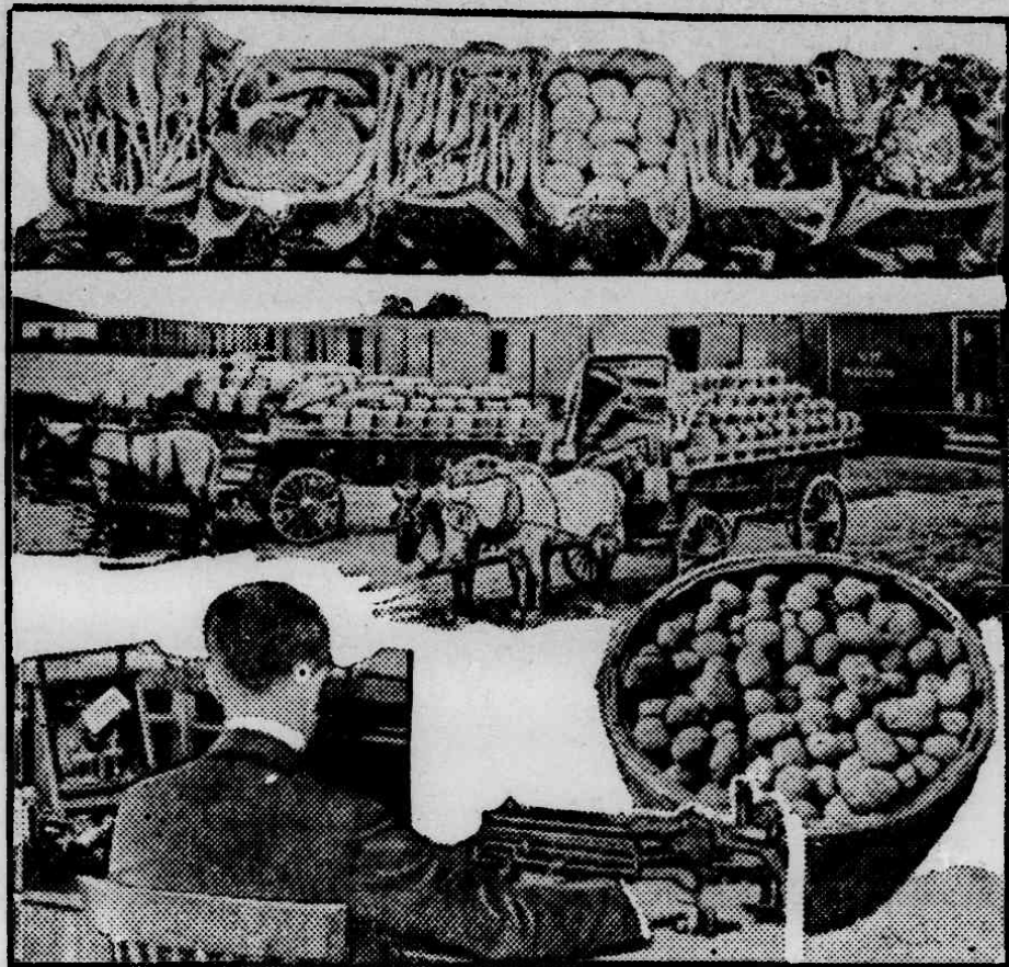
Telegraphic Reports From Many Centers Regarding the Movement of Many Products Form the Basis of Federal Market Dispatches.

(Prepared by the United States Department of Agriculture.)