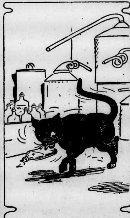
Was Seen Staggering Across the Floor.

Last week Rastus created considerable merriment when 13 colored men