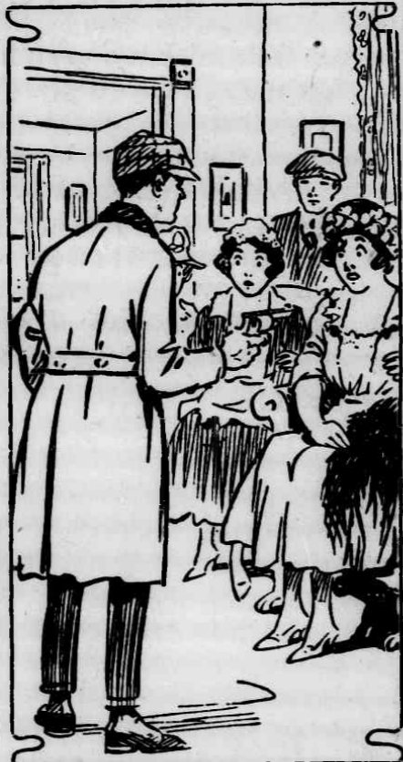
"Make Yourself Comfortable," He Said.

While the second robber was ransacking the apartment and filling two