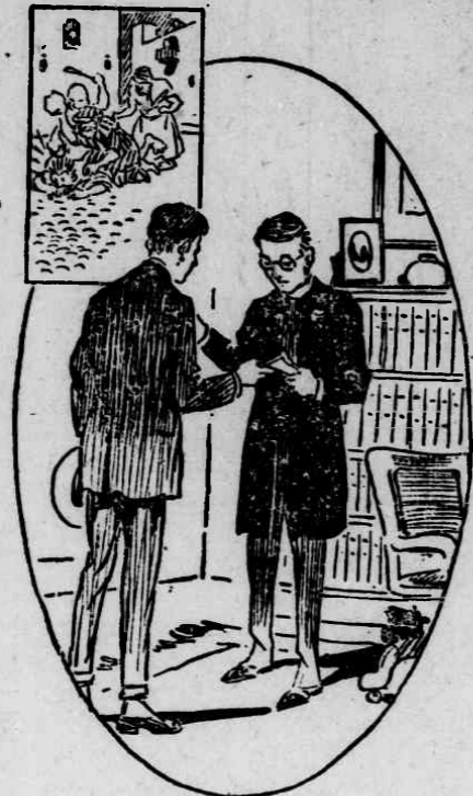
Gave Him Money.