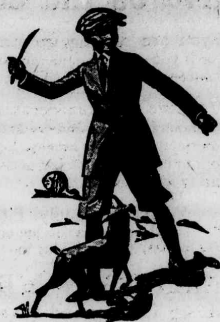
Right-Posture Boys' Clothes

we have some honest values and splendid bargains every day in the year, and because "we guarantee your money back if not absolutely satisfied. Prices of merchandise have reached an unusually low level and the pendulum is swinging towards higher prices; but while our present extra large stock of everything for Men and Boys' lasts you will get the same prices marked in plain figures. We do, however, urge you to buy right now while the price is at this unusually low level. Come in anyhow. We love to see old friends and make new ones.