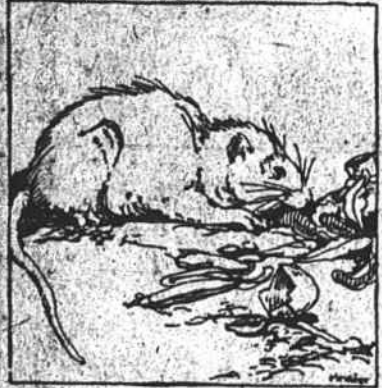
"I Don't Know That I Can Boast About Myself!"

"It's all because we're not fussy," said the Brown Rat. "We're not popular. We're just ordinary, common, plain rats. "There is nothing about us that is interesting. We're not nice as some rats are—that is no one seems to say a good word for us. "And I don't know that I can boast about myself, except of course I'm smart and so are all of us smart. "But we're not beautiful as some rats really are—the Australian rat I've heard was really quite handsome. "No, we're just ordinary rats. "But we're clever. It is clever of us not to be fussy. If we were fussy it would be difficult. "As it is we always get along. No one likes us. No one invites us to come about. We aren't pets. We never will be pets. "We're not supposed to be interesting. "There is nothing about us that makes people say to us that they want us to come around, or that we are cunning, or anything of that sort. "They do not say: "Dear little rat, or dear big rat, come here and see me." "Yet they urge other animals to come to them. "Oh, well, such is rat life. We cannot mind for we cannot help it. "But we are clever. We often follow people about and go where they