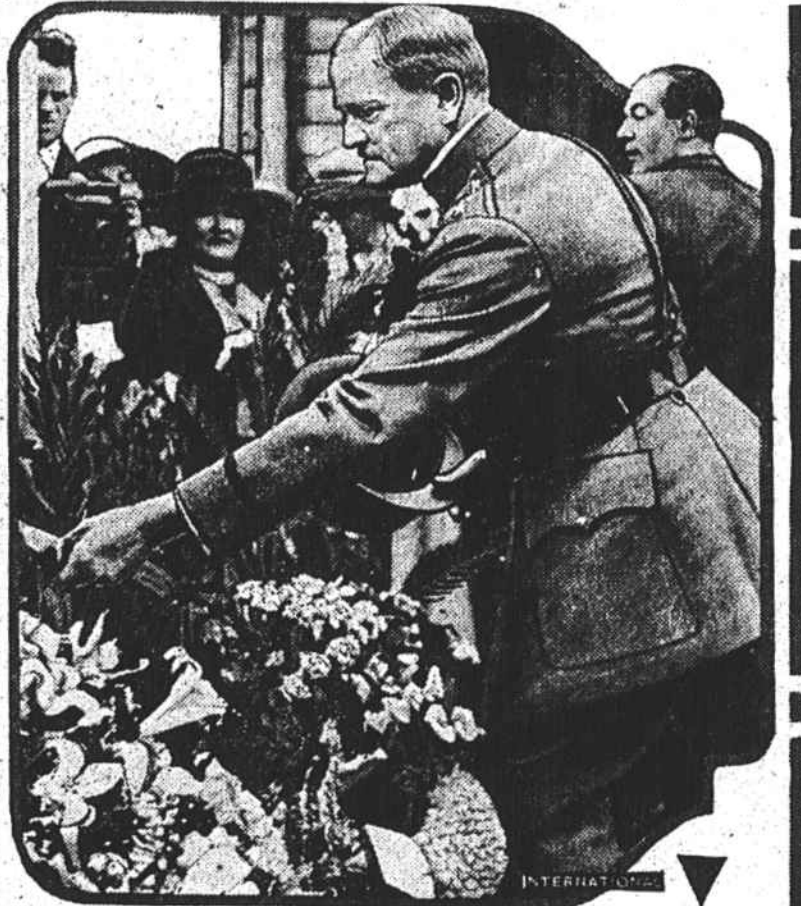
Gen. John J. Pershing making his last visit to Europe as general in the United States army. He is shown placing a wreath on the cenotaph in London. When the general returns to the United States he will retire to private life.