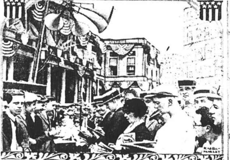
Men and women from all walks of life kept score cards on the Democratic convention. Wherever it was possible to hear the proceedings over the radio crowds gathered and indulged in the new sport.