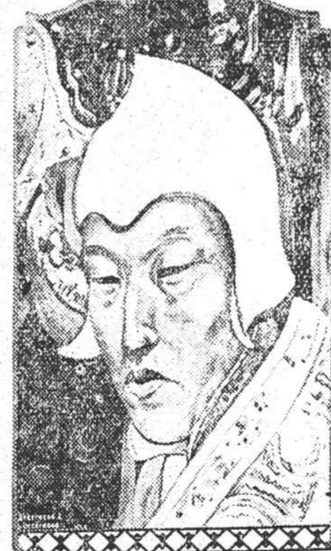
Photographic copy of painting, by Sviatoelaw Roerich, a noted Russian artist who has just come to New York from Tibet, of the Tashi Lama, spiritual head of the Tibetan people, whose mysterious disappearance recently caused a sensation in the East. This is the first time a Tashi Lama has disappeared and there is no satisfactory explanation of the affair, according to Mr. Roerich, who adds that Tibetans believe it is the precursor of great changes.