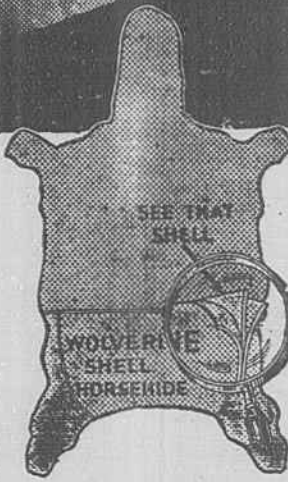
Above shows the one-sixth of the hide which furnishes the leather for Wolverine Shell Horsehide. Note the shell that gives you many extra months of wear.

In an actual test, a Wolverine Shell Horsehide and a work shoe of another make were frozen in a cake of ice 56 hours. When the ice melted, the Wolverine Work Shoe dried out soft and pliable, while the other shoe was stiff and hard! That's the kind of leather we offer you in Wolverine Work Shoes. Come in and compare the many other Wolverine features of comfort and long wear—at prices that save you money in the long run.