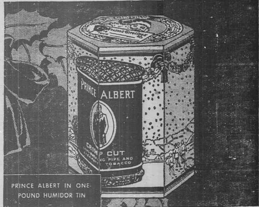
PRINCE ALBERT IN ONE POUND HUMIDOR TIN