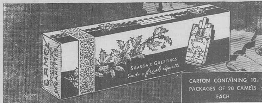
CARTON CONTAINING 10 PACKAGES OF 20 CAMELS EACH