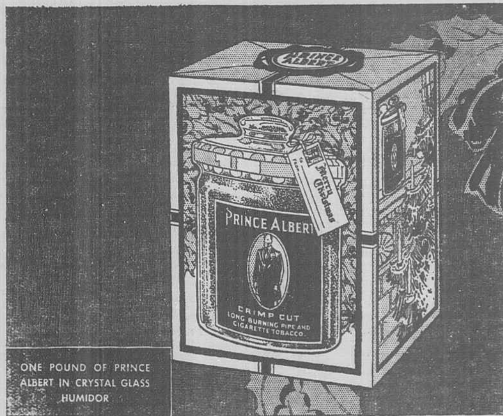
ONE POUND OF PRINCE ALBERT IN CRYSTAL GLASS HUMIDOR