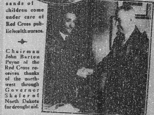
Chairman John Barton Payne of the Red Cross receives thanks of the northwest through Governor Shafer of North Dakota for drought aid.