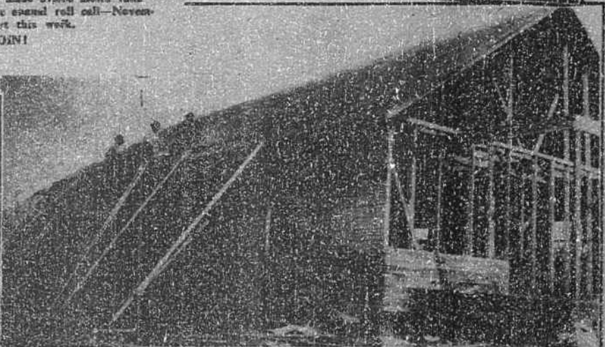
Home of a family of 13 razed by tornado. The mother was killed. The new home was provided by the Red Cross.