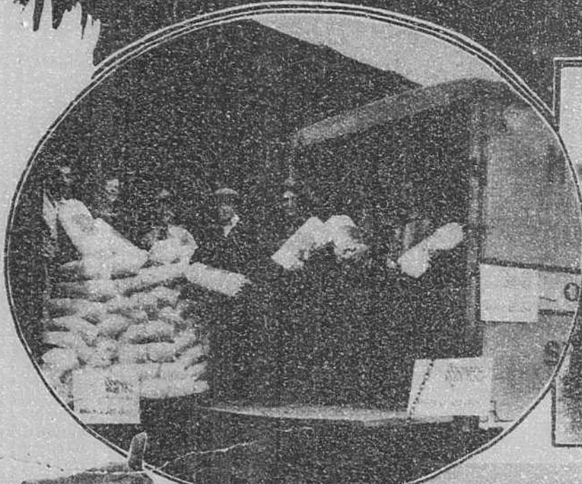
Use of trucks was donated and unemployed men distributed free Red Cross flour in many counties.