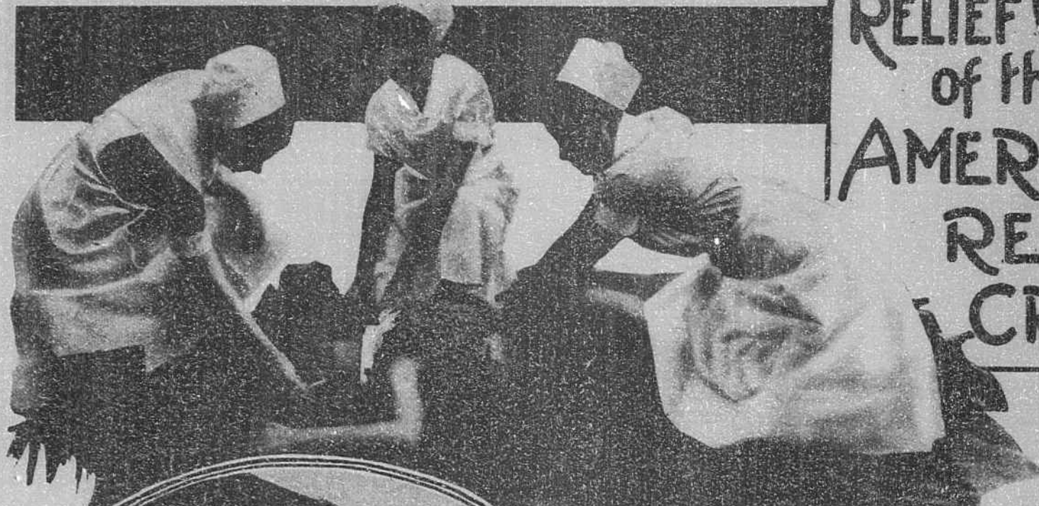
Student nurses are taught Red Cross first aid and water safety methods.