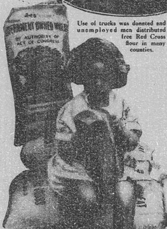
By-products of Farm Board wheat given Red Cross—first, flour; second, bread; third, a dress for the little girl, made from the sack.