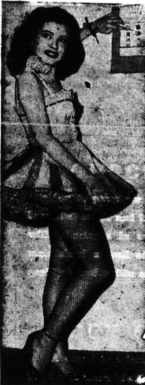
LOVELY Gloria De Haven, film starlet, points to the calendar to remind observers that today and every day is a good time to buy war stamps to the tune of $130,000.00. The money will be used to build U. S. Navy's new aircraft carrier "Shangri La."