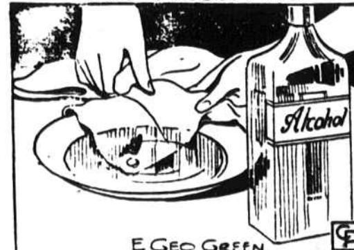
Alcohol, grain or wool, will help remove marks on clothing made by indelible pencil. Soak the stains in the alcohol for a few minutes or until they are dissolved, then wash with soap and water. The alcohol is effective also after these stains have been washed and ironed, if some still remain.