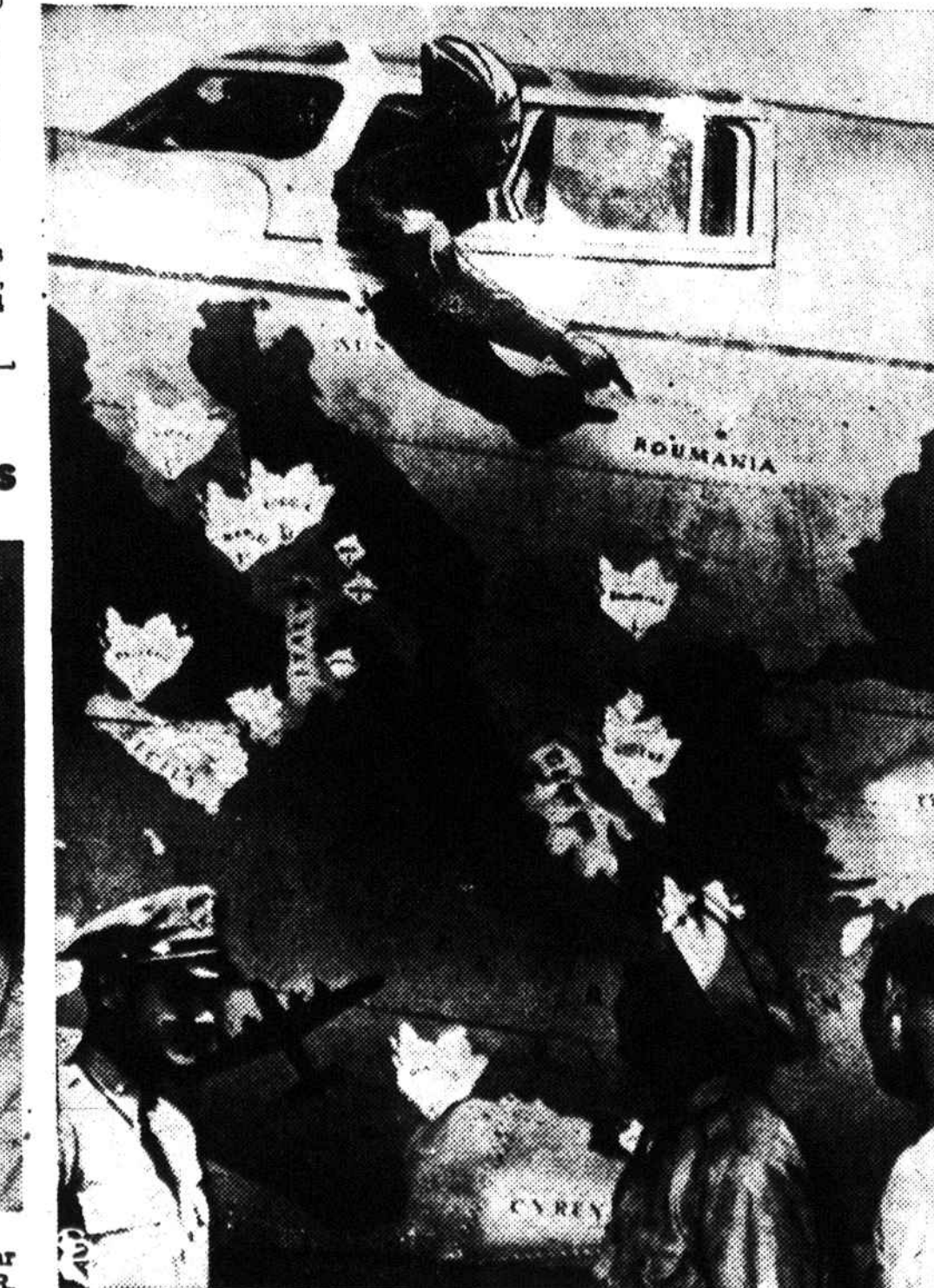
CAPT. R. L. LEBRECHT, pilot of one of the U. S. Liberators that participated in the bombing of the Ploesti oilfields in Roumania, shows a map of the area to fellow airmen in Washington after the plane was flown back to this country. This and other planes that took part in the raid are scheduled to make a tour of the U. S.