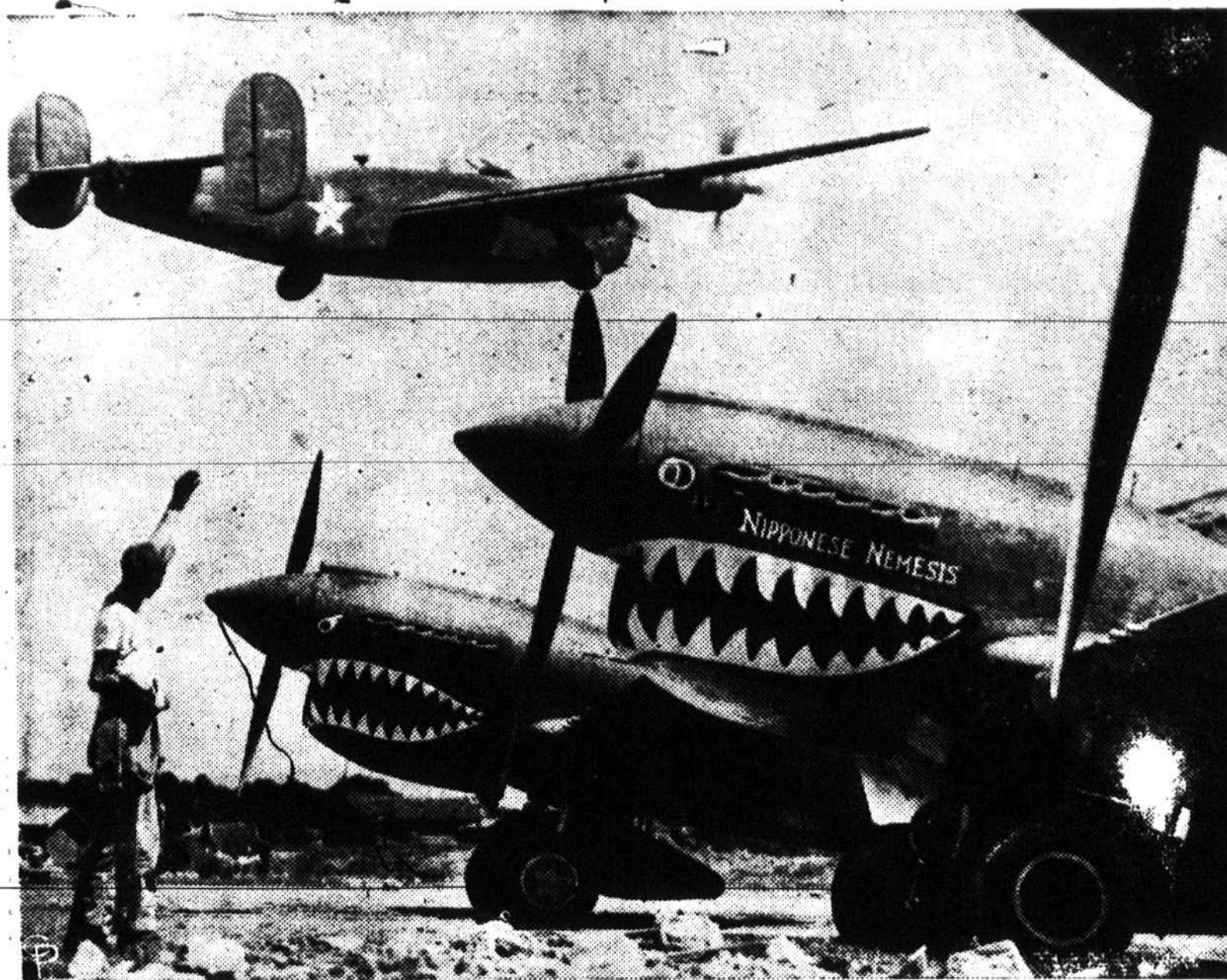
A GROUND CREWMAN of the U. S. 14th Air Force waves goodbye and good hunting to an American B-24 Liberator bomber as it wings over a line of shark-nosed fighter planes at an American base in China. The craft, landing wheels folding up, is on her way to bomb some more Japanese installations.