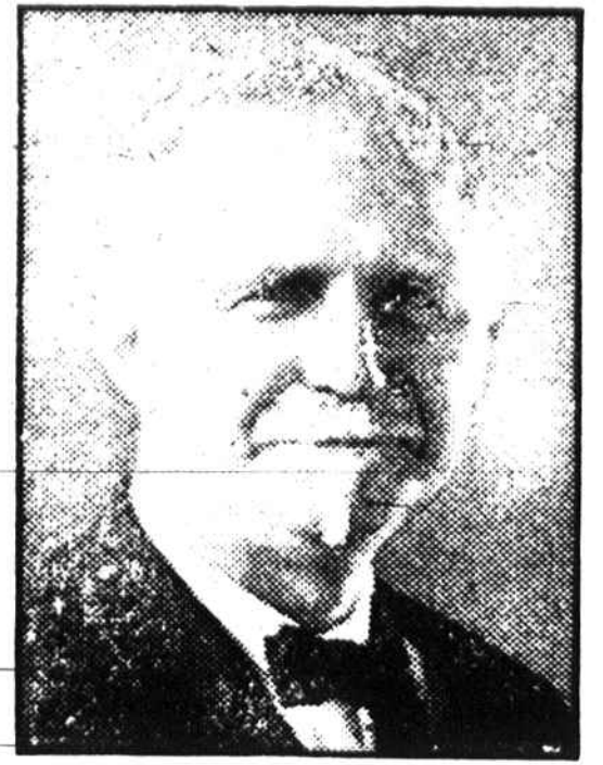
ROGER W. BABSON

What About 1944? ... read ROGER W. BABSON'S BUSINESS and FINANCIAL OUTLOOK