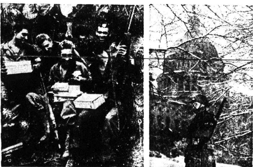
Christmas Eve in Buna, New Guinea. Right: Our national capital in Christmas mantle of snow.