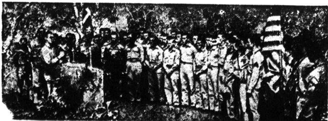
Celebrating Christmas in New Caledonia—for freedom's sake.